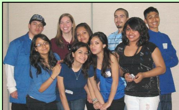
2010 Latino Youth Development & Leadership Committee

What do the youth who are members of the Committee have to say about their experiences? They find the work challenging, but always fun. As one committee member said, "We get to do good work with friends. It's great!"